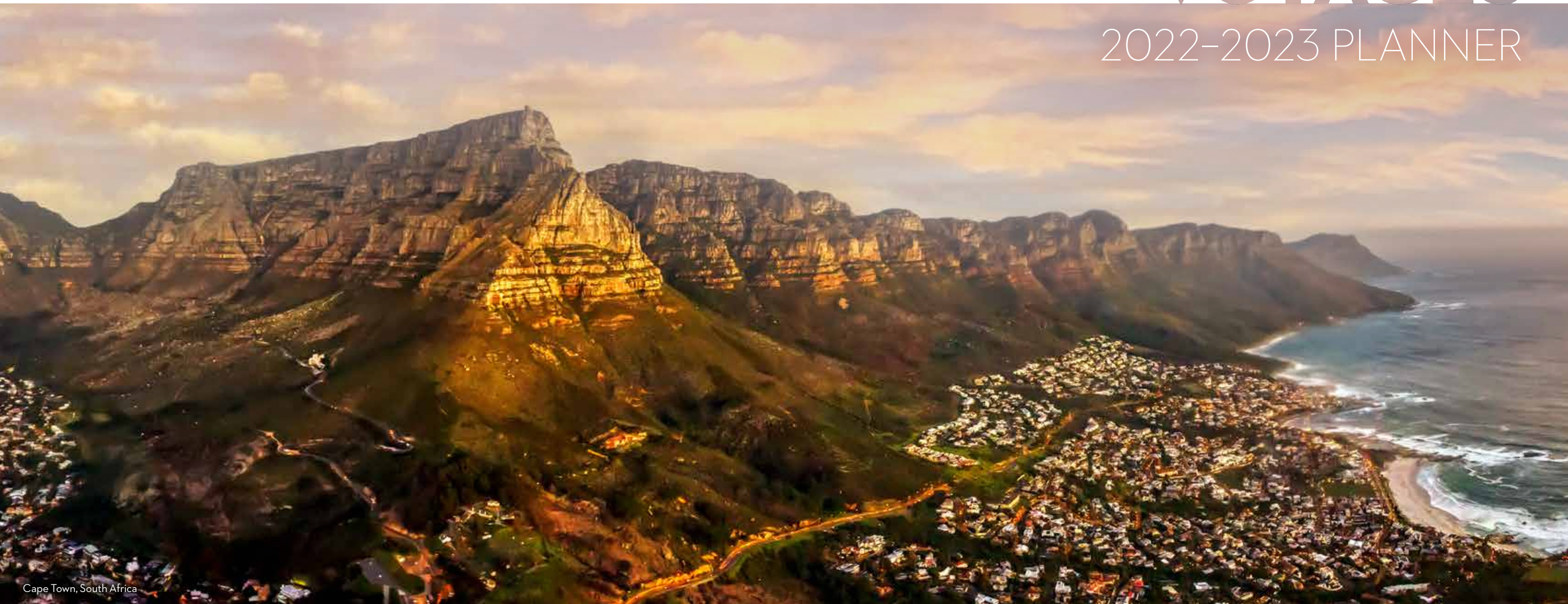
Cape Town, South Africa