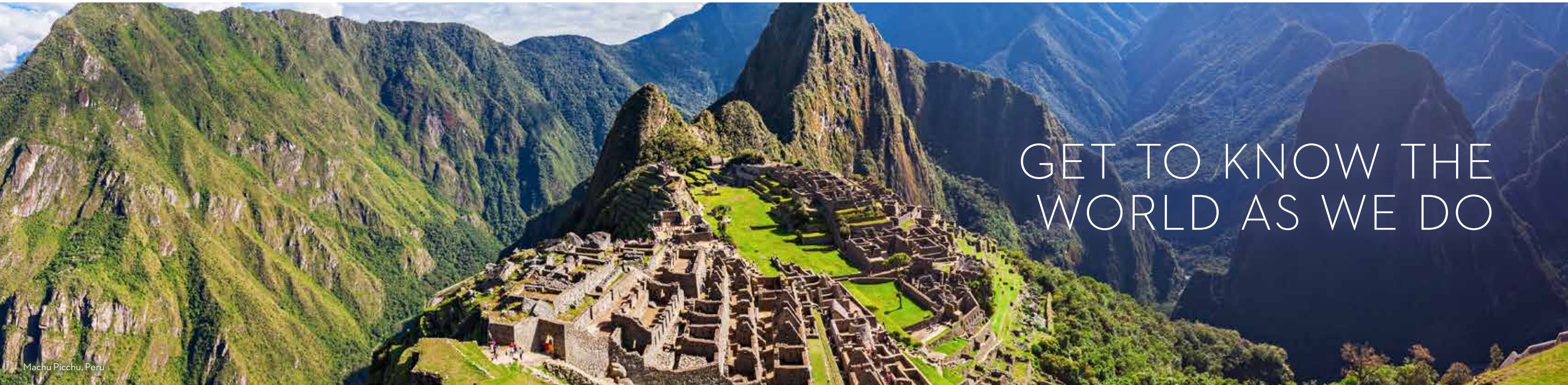
Machu Picchu, Peru

Go beyond the usual tourist track and experience amazing new places and cultures in an authentic way. Holland America Line's exclusive destination programming is designed to deepen your understanding of the places you visit. Indispensable travel resources and opportunities to engage with our own experts, as well as local insiders, make exploring each port of call more vivid and meaningful.