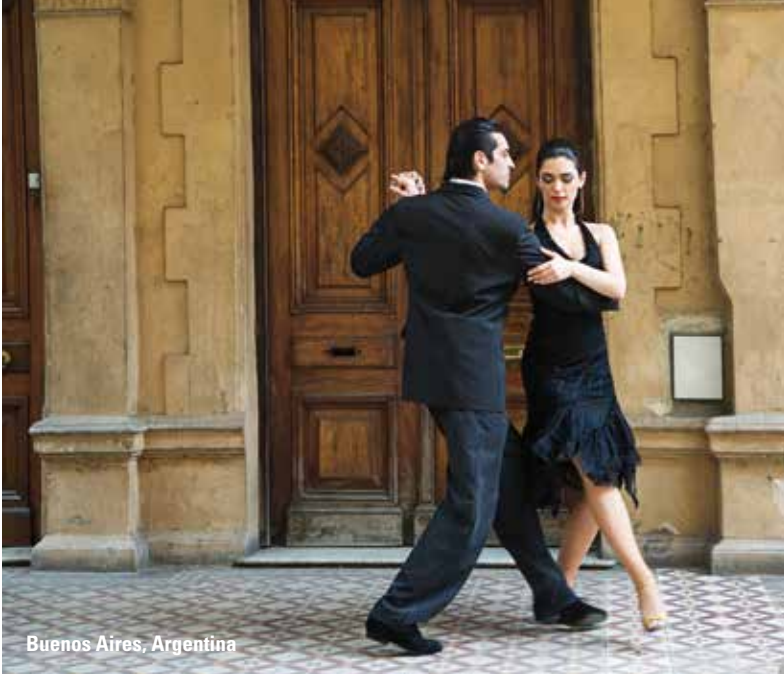
Buenos Aires, Argentina