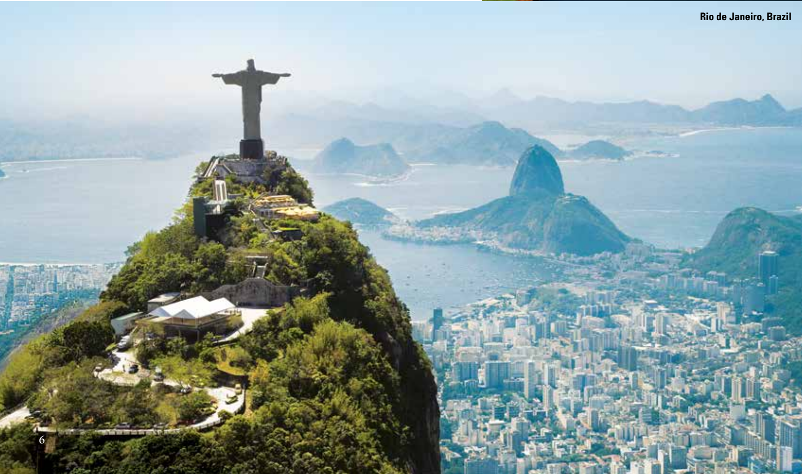
Rio de Janeiro, Brazil