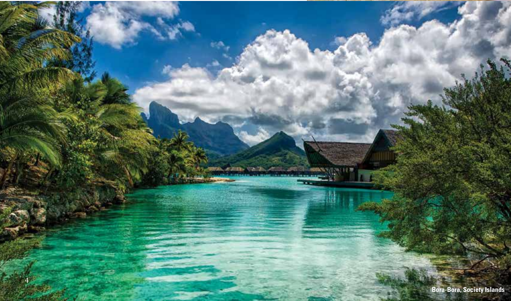
Bora-Bora, Society Islands

Guests explore over 40 ports of call and overnight in six magical cities, all while enjoying the pleasures of the mid-sized ms Amsterdam .