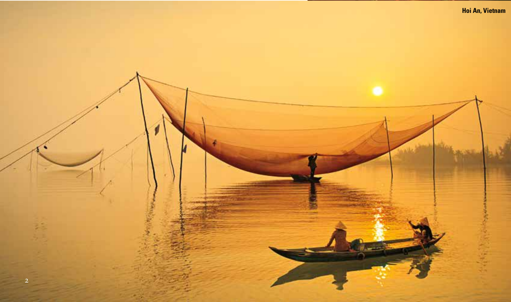
Hoi An, Vietnam

After sailing east to the exotic worlds of Japan, China and Indonesia, this voyage ventures Down Under and through the South Pacific, overnighting in six iconic cities along the way.