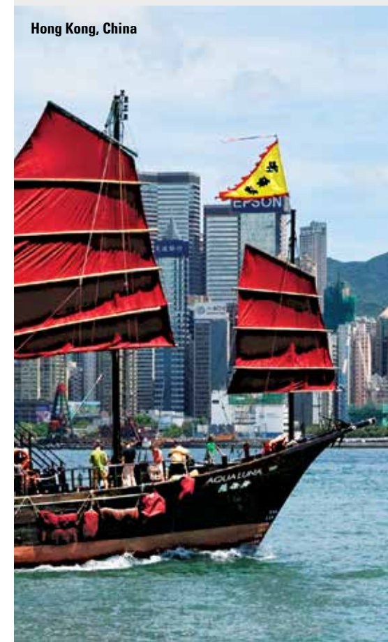
Hong Kong, China