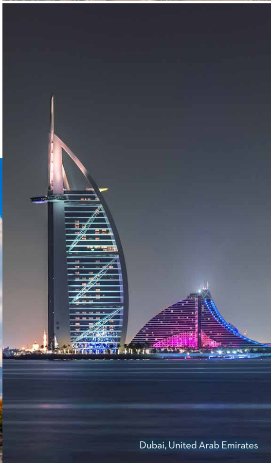
Dubai, United Arab Emirates

Many crew members are Grand Voyage veterans with personal insights into the destinations we visit. There is nearly one crew member for every two guests, and the warmly attentive service and length of a Grand Voyage create a special bond between crew members and guests.